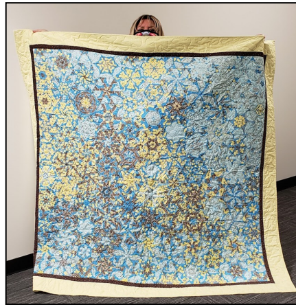
#6. Teresa Galegher Quilted by self Pattern Name: One Block Wonder