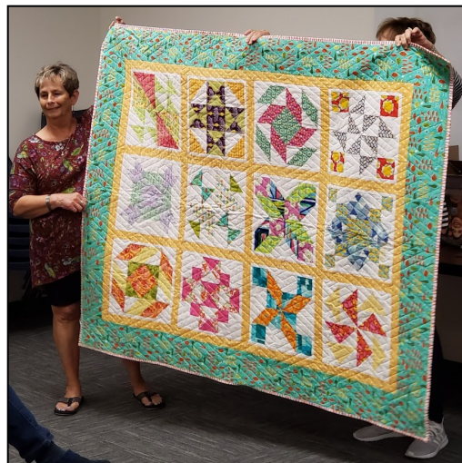
#8. Mona Levingston Name of Quilt: BOM #7 Quilted by self Pattern: BOM at "Sew It Up" Description: Turquoise and orange blocks